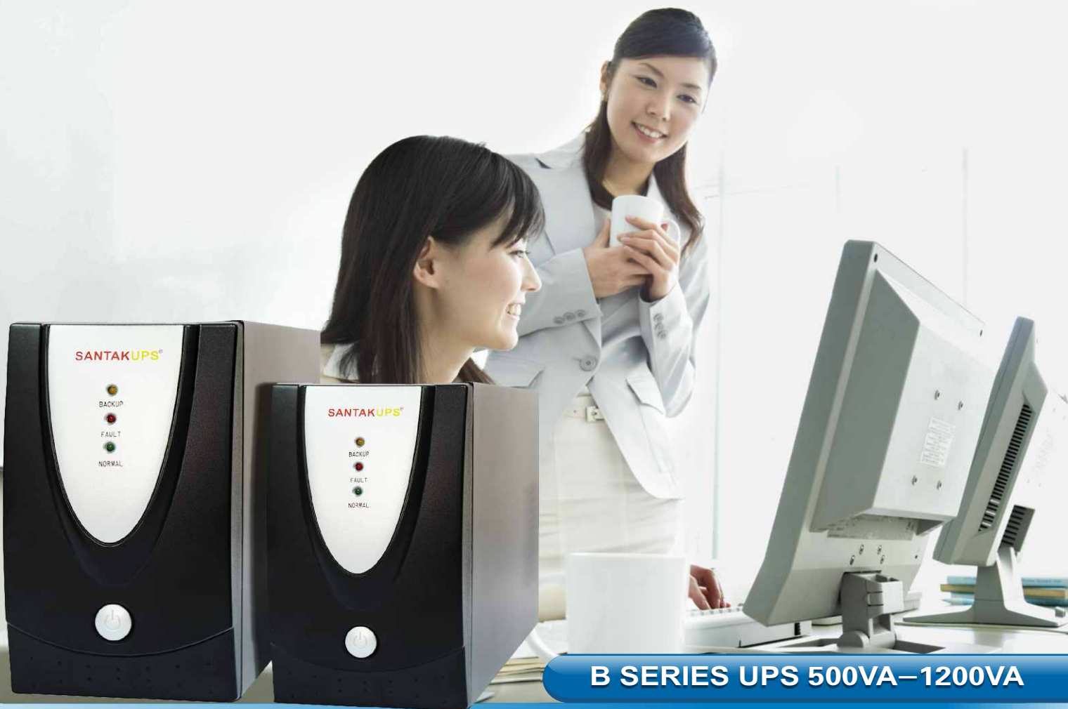
B SERIES UPS 500VA-1200VA